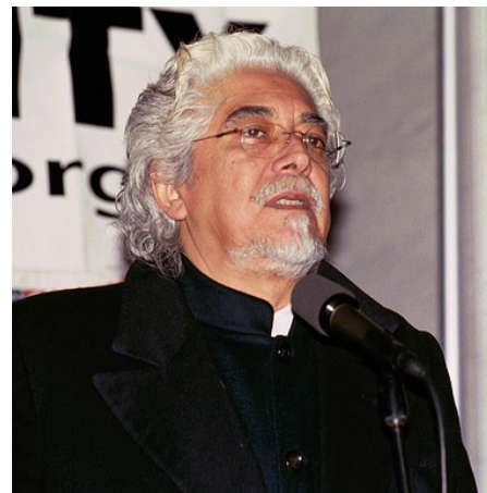
FDR Memorial sculptor Robert Graham.