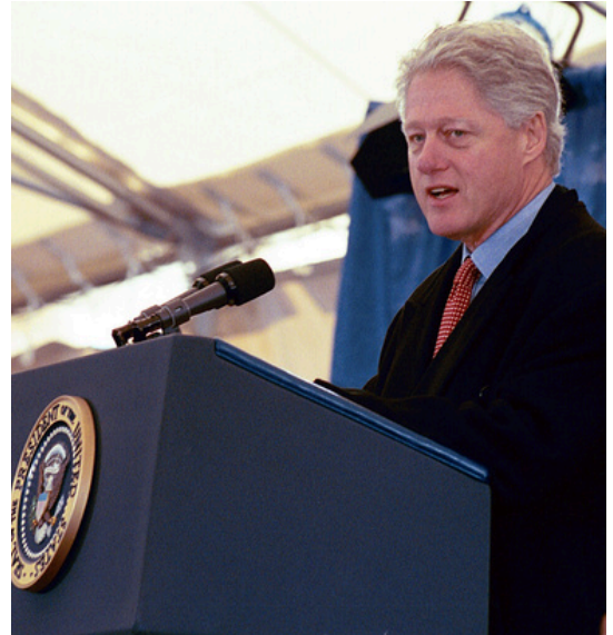
President Clinton speaks at the 2001 dedication.