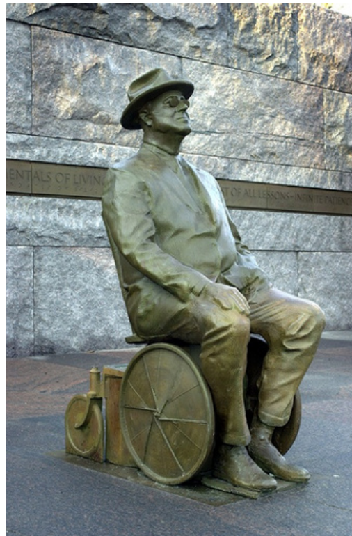
The statue of FDR in his wheelchair at the FDR Memorial.