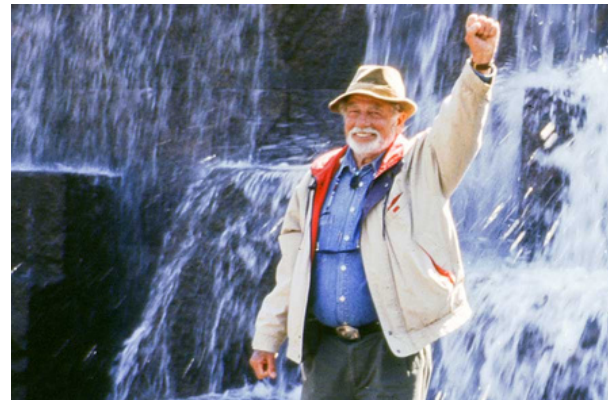
Memorial designer Lawrence Halprin at the FDR Memorial.